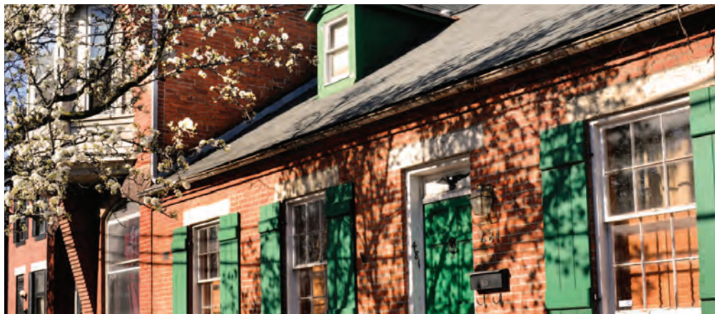
THIRD STREET - it's Columbus's own Bourbon Street

“ Proximity to downtown Columbus is one of the perks of living in the historic German Village, which sits in the southern shadow of the city’s skyline.” - Angie’s List