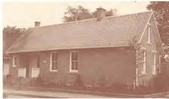
◀ 3. 300 Jackson Street