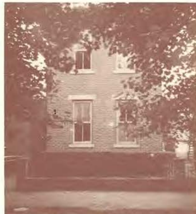
▲ 10. 1023 City Park Avenue