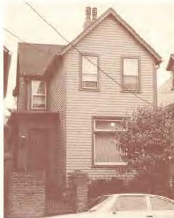
▲ 7. 722 South Sixth Street