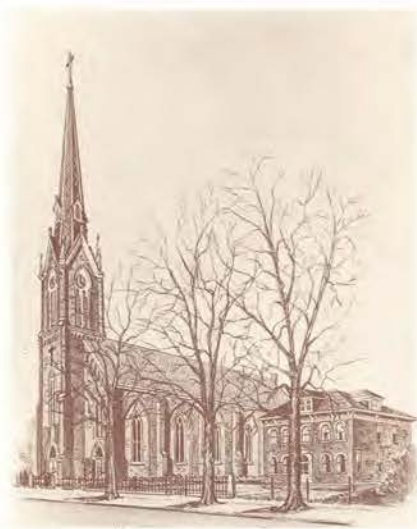
St. Mary Church and Parish House

Many visitors to German Village like to begin Tour day with morning worship. These churches welcome you to morning services: Livingston Avenue Methodist, Fourth Street and Livingston Avenue • St. John's Evangelical Protestant, 59 East Mound Street • St. Mary Catholic Church, Third and Sycamore Streets • St. Paul's Evangelical Lutheran, 322 East Stewart Avenue • South Congregational, 16 East Stewart Avenue • Zion Lutheran, High and Columbus Streets • Trinity Lutheran, South Third at Fulton Street.