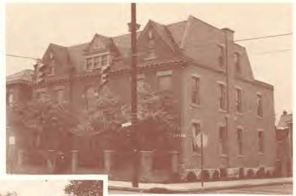
▲ 1. 291 East Livingston Avenue