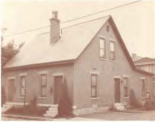
◀ 2. 298 East Blenkner Street